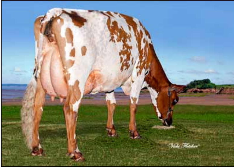
DAM PICTURED: FOREVER SCHOON PERFECTA-ET, EX-96